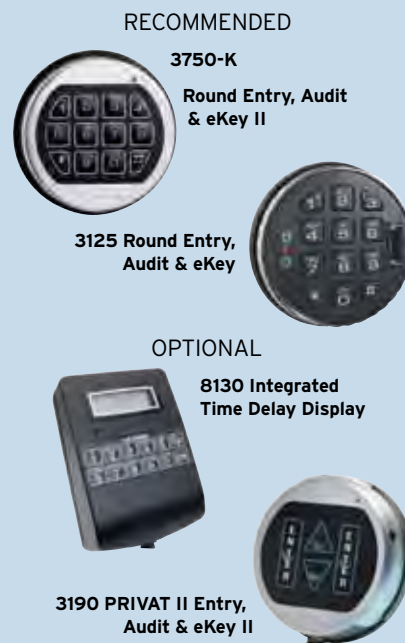
Multiple Entry Options